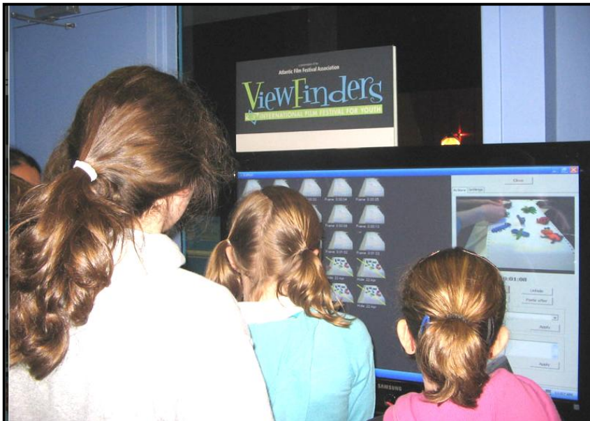
Artech Claymation Workshop at Viewfinders 2009

from "The Beautiful Toothbrush and the Grilled Cheese Sandwich" by Amanda and Jonathan